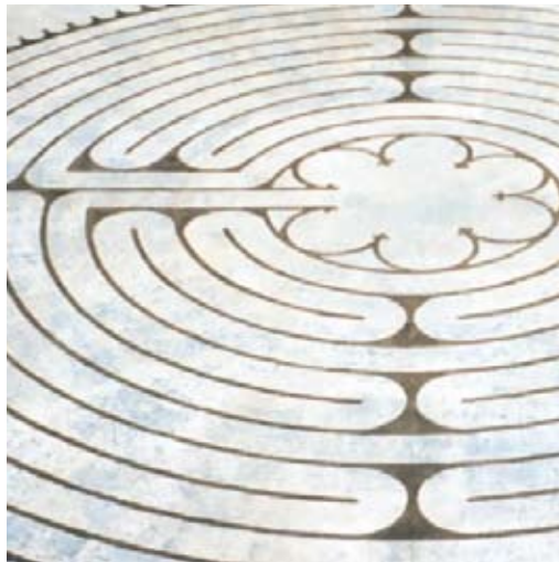
OUR LADY OF FATIMA RETREAT HOUSE INDIANAPOLIS, INDIANA

WITH ONE ENTRANCE AND A CENTER, A LABYRINTH WALK MIRRORS A LIFE JOURNEY. WALKED ALONE OR WITH OTHERS, THE JOURNEY OF CONTEMPLATION AND MEDITATION TOWARDS THE CENTER FOSTERS ENLIGHTENMENT—WITH NO TWO JOURNEYS THE SAME. THE SPIRITUAL GROUNDS' LABYRINTH SERVES AS YET ANOTHER PATH TO SELF-DISCOVERY AND A REMEMBRANCE OF OUR HUMANITY.